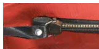
Heavy duty BDM metal zip