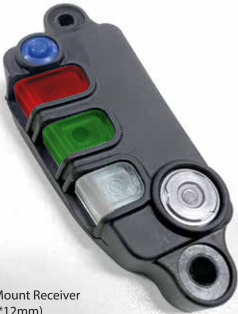
Head Mount Receiver (73*35*12mm)