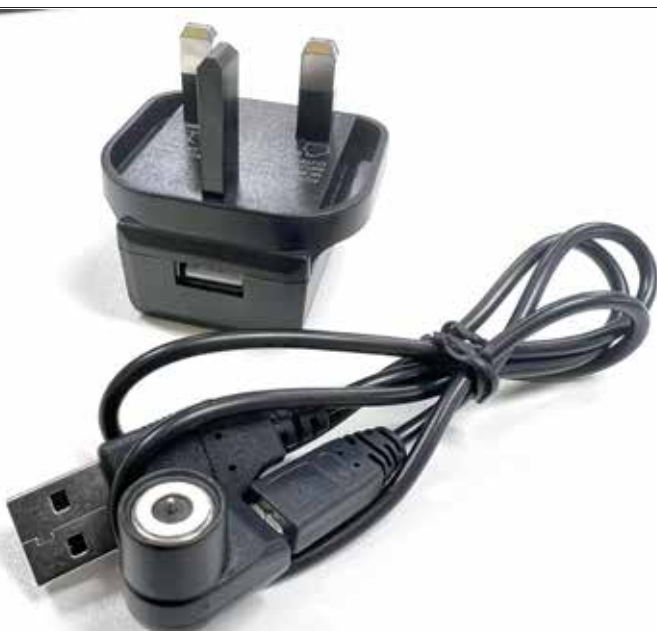
Magnetic charging cable