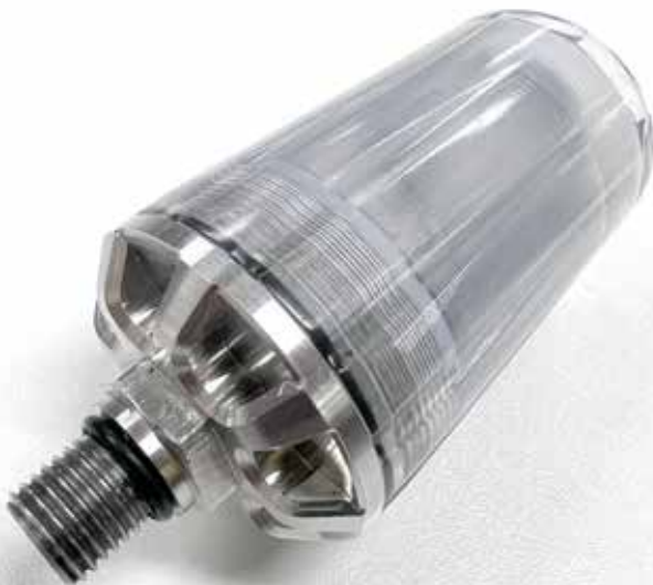
Pressure Sensor (2 supplied) (85*40mm)

Bluetooth sensors, manufactured to comply with all relevant standards, made from the highest quality materials to ensure reliability and robust in all environmental conditions. Screw thread connection 7/16x20UNF to fit all H.P. first stage regulators. Transmitter is powered by a user-replaceable 3v lithium CR123A battery. Replacement battery kits also contain a new O-ring and cover, which must be changed at the same time. Battery life is around 1 year (at 100 dives per year).